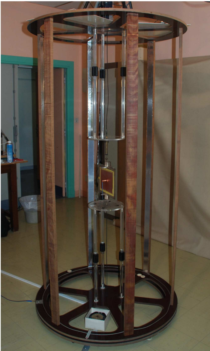
FIG. 2: The experimental setup.